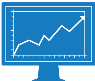
Figure 1 below shows the high level corporate business drivers and ways to manage and monitor them to drive operational and asset level excellence and efficiencies across the company.

With Rolta OneView™ and SAP software, including rapid-deployment options, you can gather and analyze data across key areas of the business to support informed decisions that can help you improve performance.