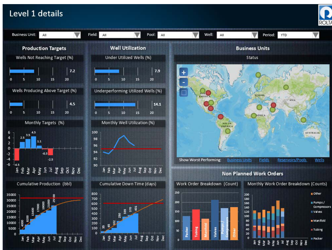
Figure 3 - Rolta OneView™ Upstream Executive Dashboard Details

Knowledge Model: Various oil and gas vertical specific knowledge models (such as from Reservoir, Drilling, Production, Facilities, etc...) when combined with functional knowledge models involving Assets, Operational and more models