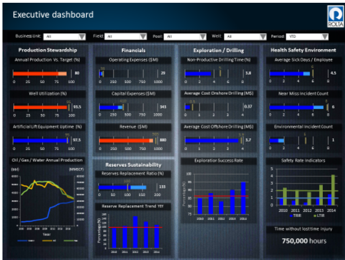
Figure 1: Rolta OneView™ Upstream Executive Dashboard

Some of the key benefits Rolta OneView™ delivers are: